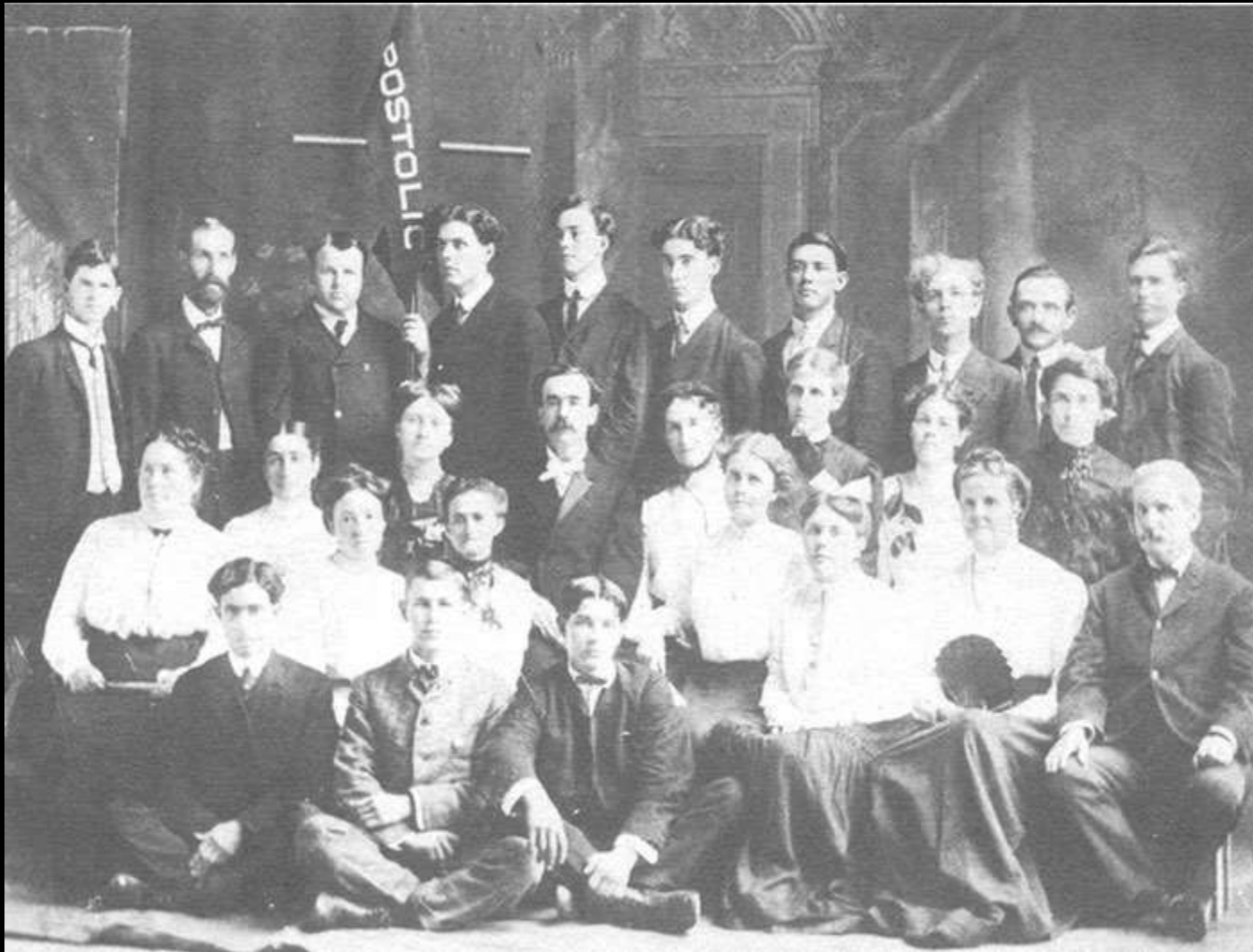
Bethel Training Center Topeka, KS